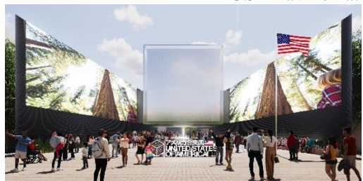
USA Pavilion at World Expo 2025

years after the Aichi Expo 2005 and 55 years after Osaka Expo 1970. This will be the third time Osaka hosts a World Expo and the sixth time Japan hosts a World Expo. The theme of Expo 2025 Osaka is "Designing Future Society for Our Lives". The theme of the USA Pavilion (pictured below) is "Imagine What We Can Create Together" which will highlight U.S. efforts to develop advances in sustainability, space exploration, education, and entrepreneurship by encouraging exchange, collaboration, and growth. Musicians, dancers, artists, speakers, and chefs representing various regions throughout the United States will provide education, entertainment, and inspiration to millions of visitors. The Pavilion will also offer regional American cuisines and an authentic retail experience. The USA Pavilion will hold its national day – a day of entertainment, special guests, music, and parades – on Saturday, July 19, 2025. For more information see: <a href="https://jp.usembassy.gov/us-breaks-ground-for-pavilion-at-expo-2025-osaka/">https://jp.usembassy.gov/us-breaks-ground-for-pavilion-at-expo-2025-osaka/</a>.