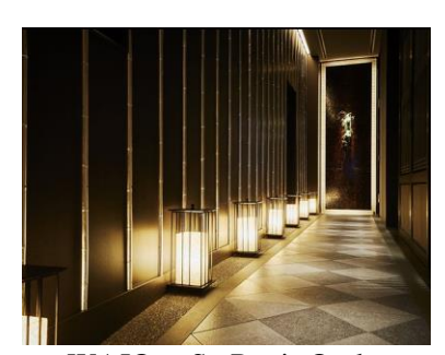
WAJO at St. Regis Osaka

With the two aforementioned major events on the horizon – the IR project and Expo 2025 – many hotels in the Kansai region are looking for new, innovative ways to attract domestic customers as well as appeal to a wider international audience. As the number of foreign visitors increases, hotels are also adapting their restaurants and services to meet these needs. One of the most notable changes is seen in Japanese cuisine restaurants, with teppanyaki (tabletop hot plate) restaurants being particularly popular among tourists. For example, The St. Regis Hotel in Osaka, despite its New York-themed décor, recently opened its first teppanyaki restaurant called "WAJO", featuring an entirely Japanese-style interior and offering menus such as Kobe beef to cater to the tastes of visitors. Other hotels such as Conrad Osaka, Hilton Osaka, and others have also introduced Japanese-style restaurants to accommodate this trend.